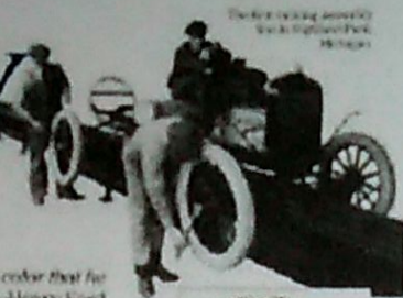
The first factory assembly line was in Highland Park, Michigan

"Any customer can have a car painted any color that he wants so long as it is black." —Henry Ford