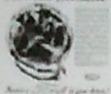
The first factory assembly line was in Highland Park, Michigan