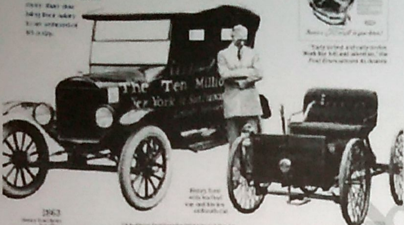
Henry Ford with his first car, the Ford Model T